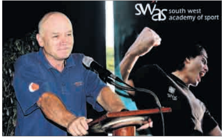
Ric Charlesworth speaks at a SWAS breakfast in Bunbury last week.